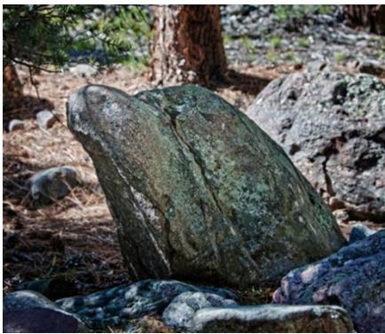
Dolphin Rock is one of the main ancient energy points in the Crestone Colorado Land Trust