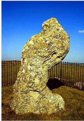
Rare spiral pointer rock. Most pointer rocks send chi straight up or at the north star and emit enough chi to feel a tingling similar to electricity above the point.