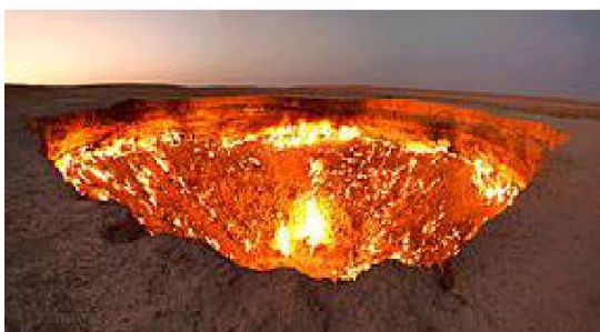
The Door to Hell

I've restored energy sites in the US over the past 15 years at my expense. There are 50 critical sites in over 25 countries I will visit in two years, some of them twice. Two of the sites: