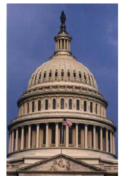
US Capitol Dome

Others include the Taj Mahal, Pantheon, many stupas, mosques, churches and government buildings. One has to wonder if the sacred site originally had a slender feature on top.