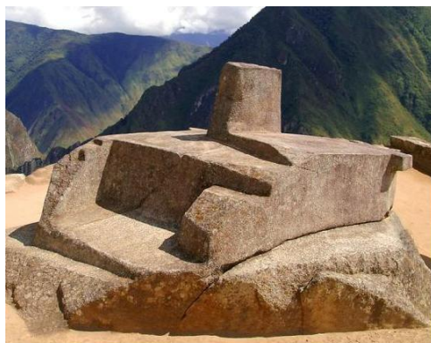
Machu Picchu's sacred Intihuatana Stone