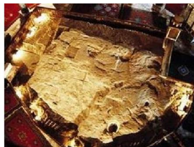
A big rock in Jerusalem which needs to shift