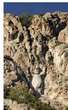
Happy people belong here