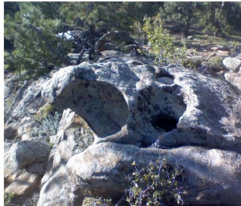
Rare double chi receiving dish. DishTV offerings pale compared to what these pick up.