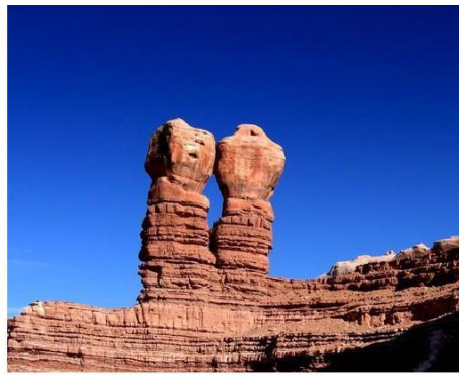
The Navajo Twins formation with great relationship chi in southern Utah

Let no one say the past is dead, the past is all about us and within." Oodgeroo of the tribe Noonuccal