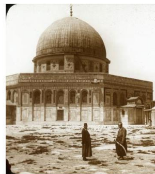
Dome of the Rock