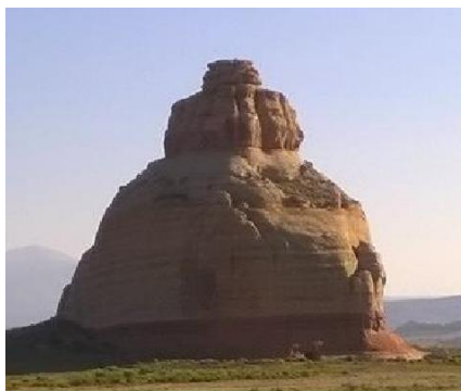
Weathered Sacred Site